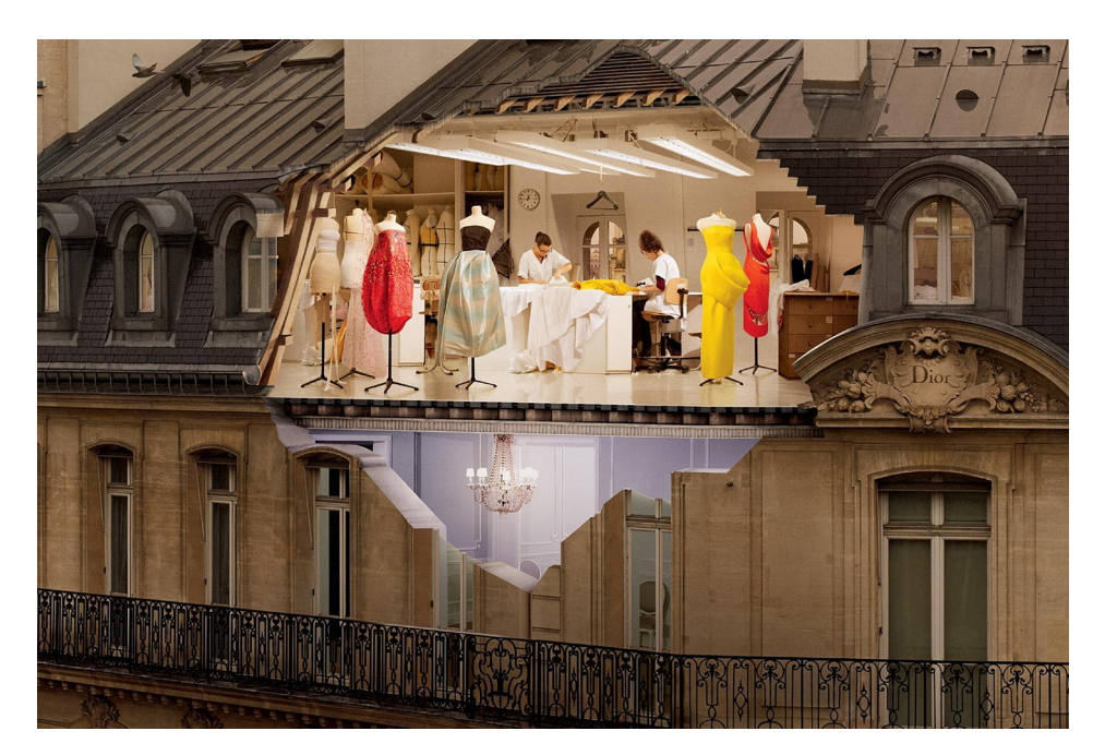
Figure 2. LVMH, Les Journées Particulières, 2013.

On the other hand, many fashion production sites, located in the provinces, have been opened to the public for visits and activities, hosted schools, associations and institutions to transfer knowledge and awareness; the most relevant example is Les Journées Particuliéres , an initiative of the luxury group LVMH launched in 2011 and now in its fifth edition, which consists of opening to the public dozens of production sites of the group's brands located in peripheral locations and small towns scattered throughout Europe (Fig. 2). This phenomenon therefore responds to the need of international luxury brands to make the value of their products tangible, to distinguish themselves from fast fashion brands through a storytelling made of people, places and know-how that encourages forms of consumer loyalty.