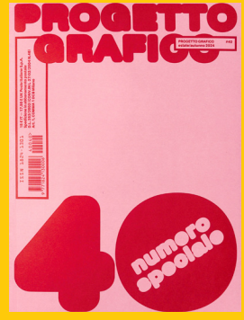
Progetto Grafico From 2003, the only Italian magazine totally dedicated to graphic design