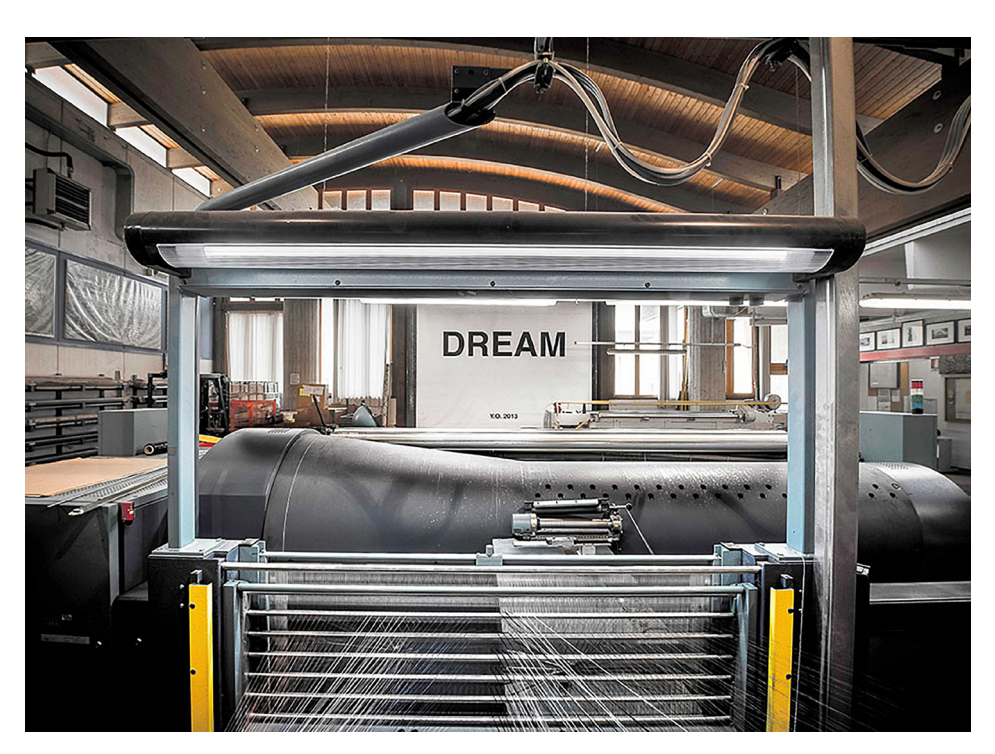
Figure 4. Bonotto, view of the factory with Yoko Ono's 2013 work Dream in the background.