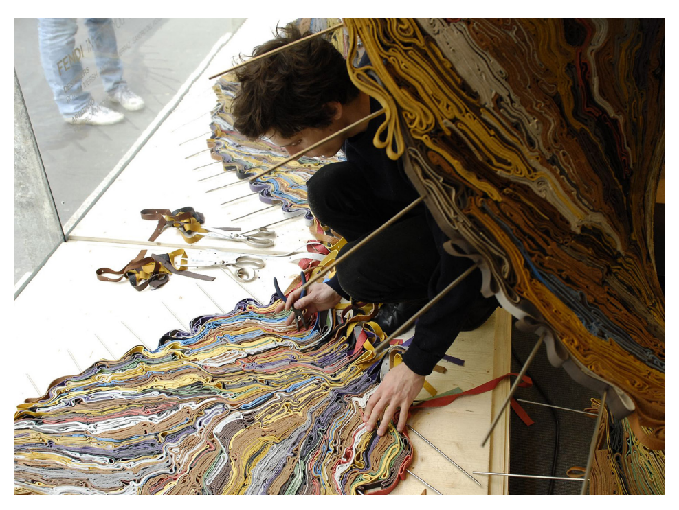
Figure 1. Rowan Mersh, Fatto a mano for the Future , Performance for Fendi, 2011 (Courtesy Rowan Mersh).

in 2009 by which the brand brought some artisans inside its shops, allowing customers to discover the different stages of making shoes, bags, watches or jewellery; Behind the intrecciato , a 2016 project by Bottega Veneta at the Dubai Mall, that included three iconic bags from the Vicenza-based brand, enlarged to become temporary pavilions inside which to discover the processes of making and weaving bags, with videos and archive pieces; Fatto a mano for the Future , Fendi's 2011 project hosted inside one of the Harrods shop windows in London, where a performance between artist Rowan Mersh and artisan Cyril Letellier was visible, allowing people to reflect on the contemporary role of the artisan (Fig. 1).