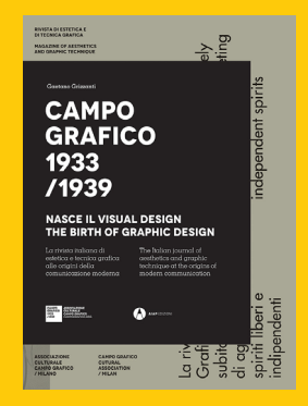
CAMPO GRAFICO 1933/1939 The Birth of Graphic Design

The International AIAP Women in Design Award