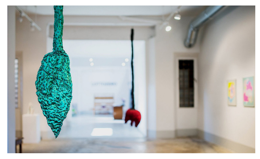
Figure 5. Lottozero, Kunsthalle.

Lottozero, thanks to the Kunsthalle, regularly promotes artistic residencies, during which creatives from all over the world can spend a period in Prato working on their own projects. The residencies offer the opportunity to come into contact with the rich textile heritage of the Prato district and to engage with local manufacturing realities. These residency programmes have led to the creation of textile works and collections that blend contemporary innovation with traditional craftsmanship, uniting past and future in a path of constant evolution (Conti & Franzo, 2020).