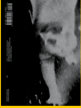
Progetto Grafico From 2003, the only Italian magazine totally dedicated to graphic design