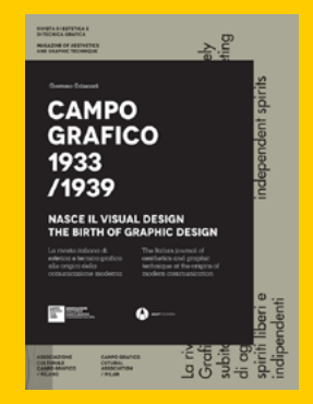
CAMPO GRAFICO 1933/1939 The Birth of Graphic Design

The International AIAP Women in Design Award