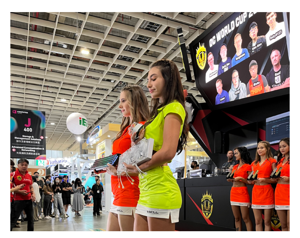
Figure 7. Hostesses parading in front of the COMPUTEX2023 public, carrying an RGB keyboard (left, in orange) and a GPU cooling device (right, in yellow).

Each time their scores get higher, canon-shaped smoke-machines are activated. In front of them a dozen hostesses dressed in flashy crop tanks and mini-skirts parade in order to keep the show running. Hired by manufacturers, these hostesses welcome visitors with the latest gaming hardware products available on the market (Fig. 7).