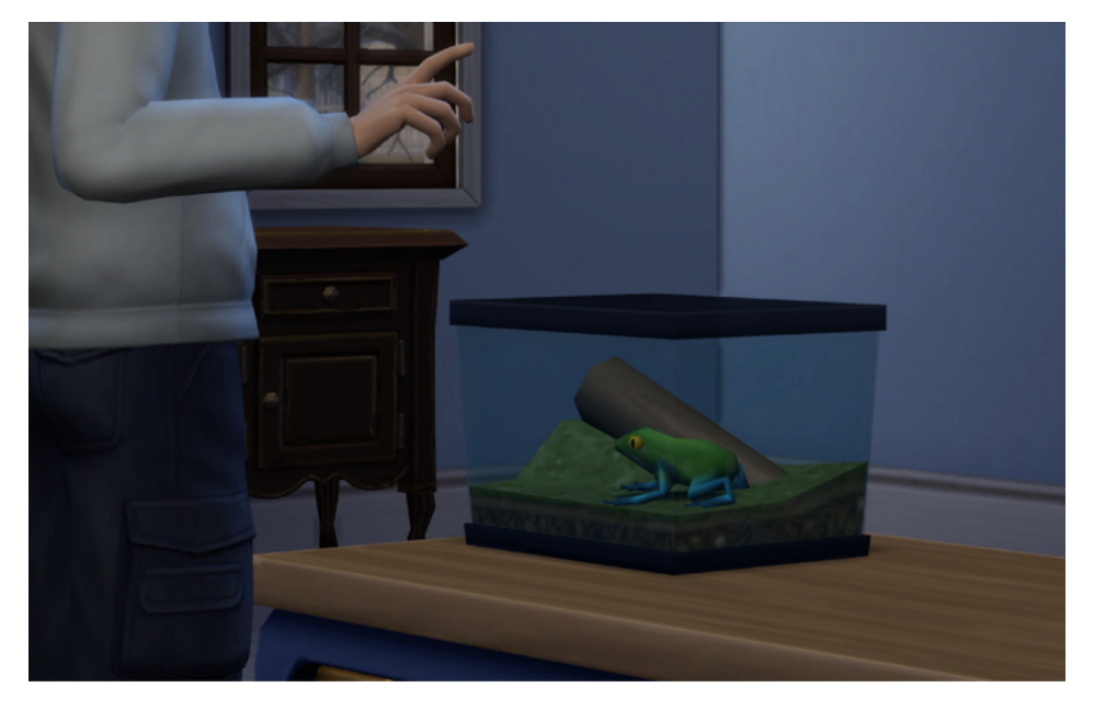
Figure 2. Screenshot from The Sims 4. Once captured, the frog can be exposed in the house, and give a decoration bonus to the sims' player.