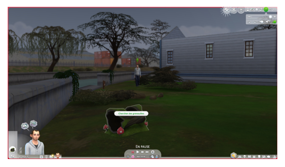
Figure 1. Screenshot from The Sims 4. The sim can search for frogs in the backyard of his newly purchased house.