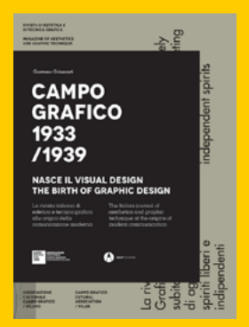
CAMPO GRAFICO 1933/1939

The International AIAP Women in Design Award