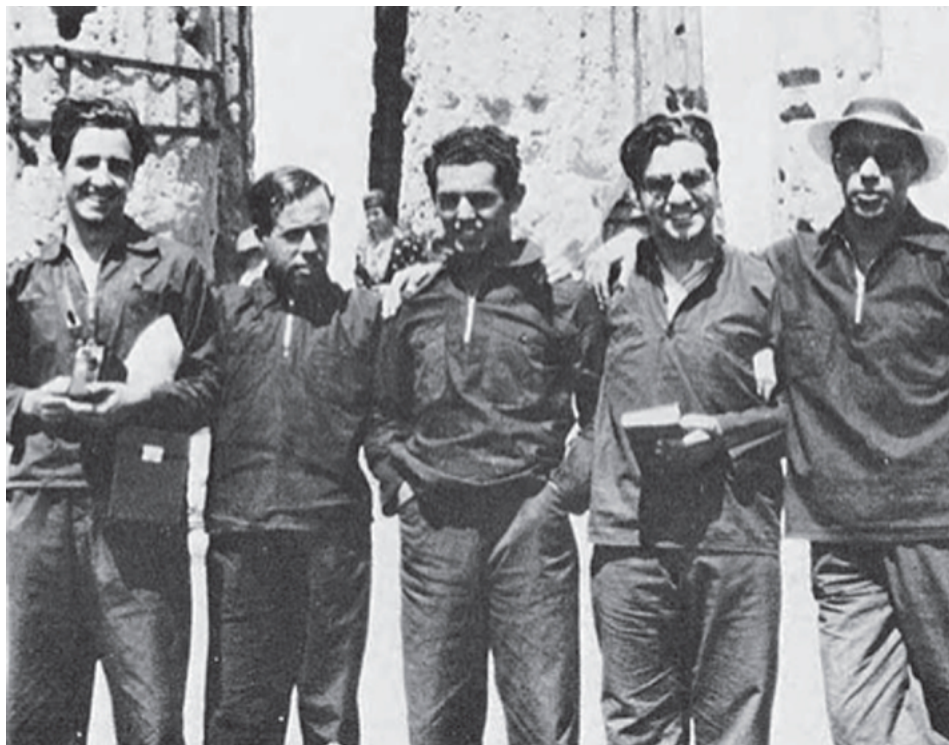
Figure 9. Delegates of GATCPAC at the IV CIAM.

As GATCPAC contribution the group presents three collages with graphics and layouts made about Barcelona: the project of City of Rest , the progress of the Macià Urban Planning and other projects essays on workers' housing. Gruppo 7 presents various projects, images and essays on the analysis and urban planning of the city of Como.