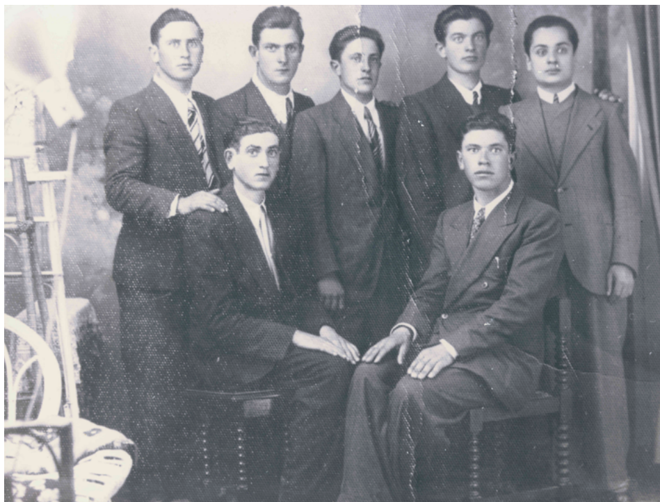
Figure 4. Members of Gruppo 7.

During this period, with the disappearance of Antonio Sant'Elia, futurism has lost its momentum and for this reason the architecture of the first years of the first post-war period offers few novelties. The predominant style is academicism, which advocates a return to the principles of classicism, while adapting them to the trends of the twentieth century. In this context, Gruppo 7 was formed in 1926 and seeks to renew Italian architecture through the adoption of the principles of