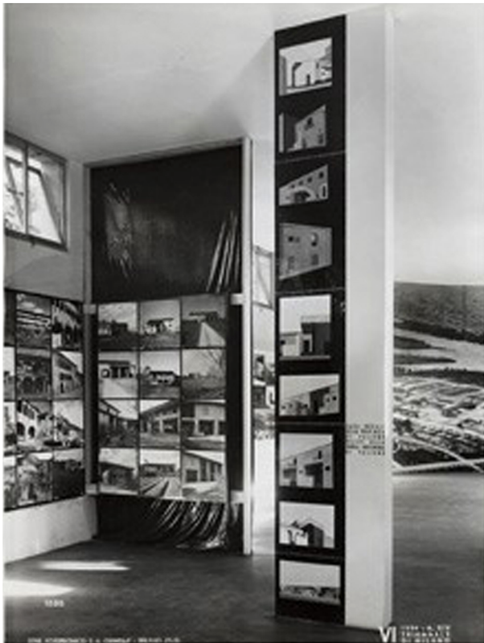
Figure 10. Mostra dell'architettura rurale nel bacino del Mediterraneo at the VI Triennale (1936).