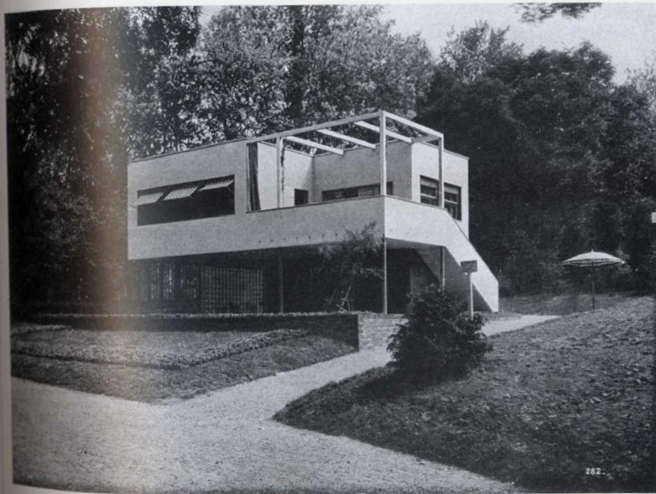
Figure 6. La Exposicion de "La Triennal" – Milán (The exhibition of 'La Triennale' - Milan) published by AC review in 1934 during the V Triennale held in May of the previous year.