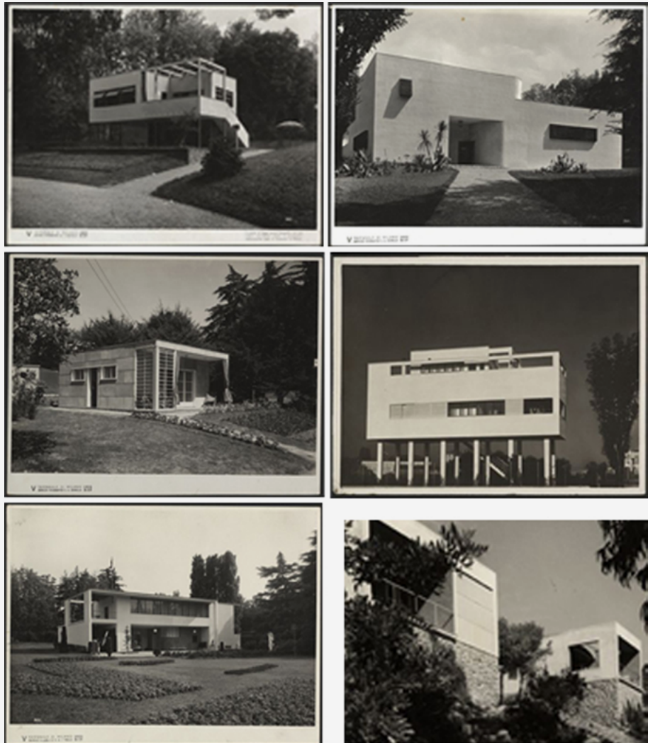
Figure 7. Similarities between the Five weekend houses at the V Triennale 1933 and the Weekend houses in Garraf by Sert and Torres Clavé.