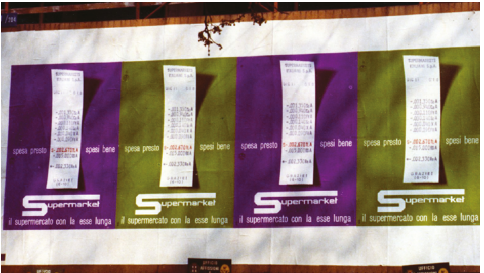
Figure 6. Simonetta Ferrante, Esselunga, posters, 1967, photo Serge Libiszewski. Courtesy of Aiap Cdpq.