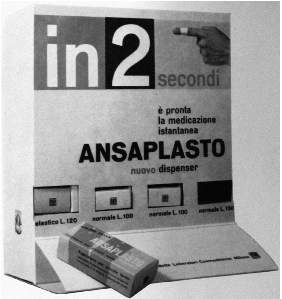
Figure 8. Studio C + M Angeretti, Ansaplasto, countertop vendor awarded the Eurostar packaging in Paris, 1963.