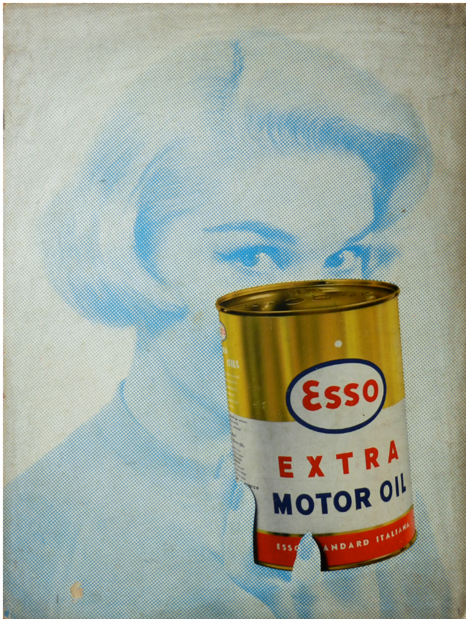
Figure 3. Claudia Morgagni, Esso Extra Motor Oil, poster, 1956.