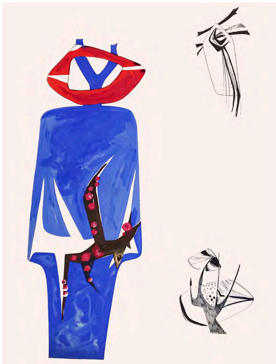
Figure 2. Clara Garesio; Study drawings; Variations on graphic decorative abstract theme and sculpture, original table size 70 x 100cm; Personal archive of the artist.