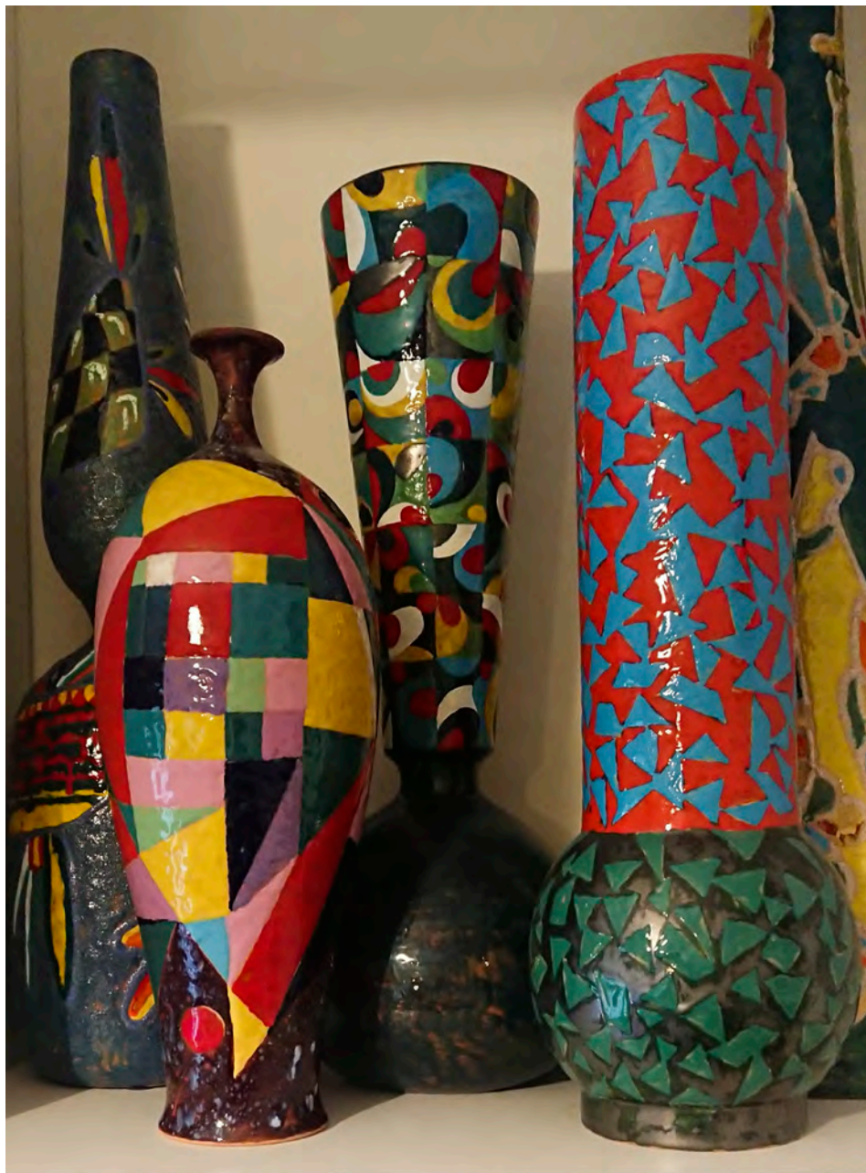
Figure 9. Vases with various decorative themes and shapes.