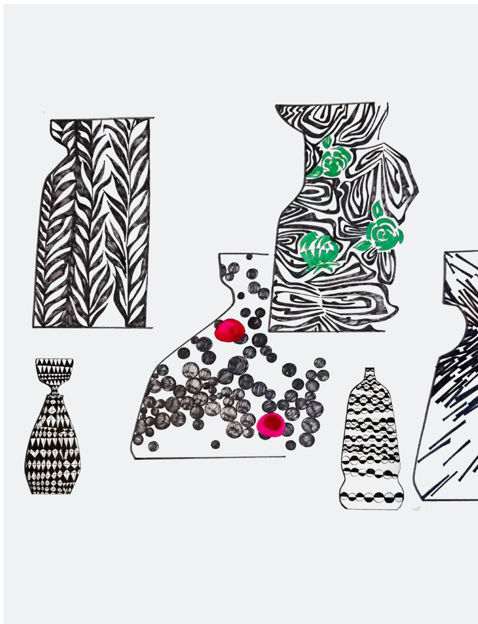
Figure 7. Clara Garesio; Study drawings; Variations on abstract decorative themes and shapes of vases, original size 70 x 100 cm. Personal archive of the artist.