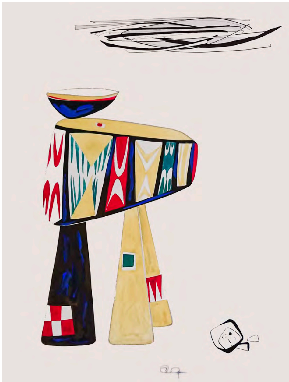
Figure 5. Clara Garesio; Study drawings; Variations on graphic decorative abstract theme and sculpture, original table size 70 x 100cm; Personal archive of the artist.