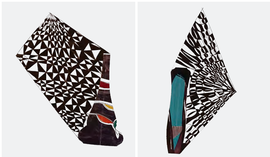
Figure 6. Clara Garesio; Study drawings; Variations on graphic decorative abstract theme, original table size 70 x 100 cm. Personal archive of the artist.

A reportage project, his research initially focused on the historical tradition and eventually reached an innovative solution, namely a series of unfinished objects . More specifically, spaghetti shaped models of ordinary objects, in drawn ceramic paste, were braided like twigs. Trays, cups, candleholders, and lamps were all used to train young apprentice craftsmen, and revealed the need to promote learning processes by using ceramic manufacture instead of finished items (Guida, 2020). It came to be an instruction manual that could be used and customised by each craftsman and as it enabled a diversified mass production.